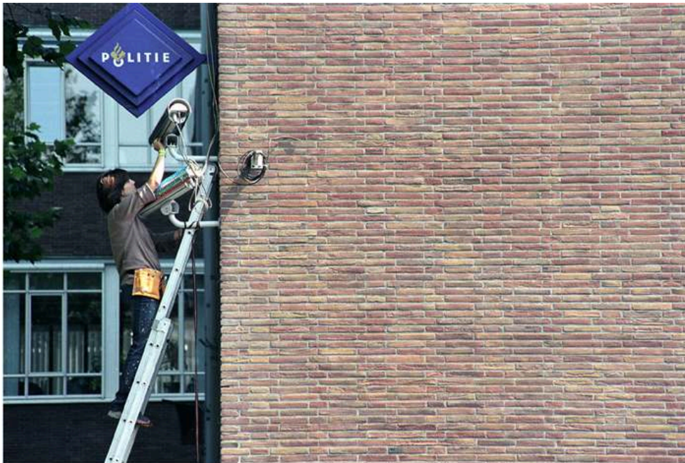
Rhinestoning Headquarters. Police surveillance cameras ornamented with fake jewels Installation view, Permanently installed at Amsterdam Police Headquarters, 2002.

p. 53 : When he finally sleeps, he goes into his room and turns on the fan. He needs to relax. He cannot relax in a foreign world he would not know where he was and would always be on guard. He needs things to stay as they are. /It's boring/, he knows, but boring is safe.